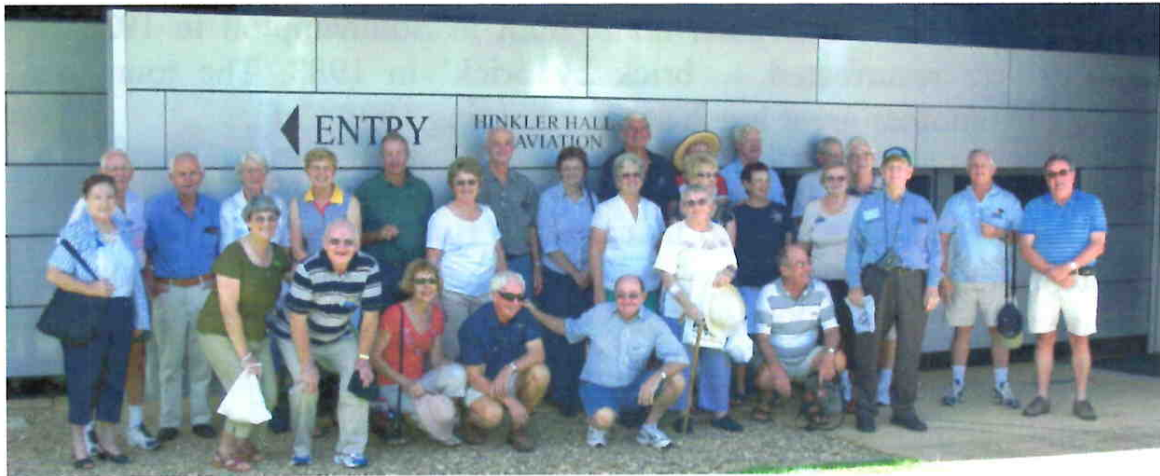
Maryborough Apex 40 Members at the Hinkler Hall of Aviation in Bundaberg

Twenty nine members of Maryborough Apex 40 travelled to Bundaberg for a weekend (March 14/15) of discovery & fellowship. TC Hamish had finally dissipated & cleared the coast & the weather was ideal. First to be visited was the “Bundaberg Barrel”, the visitors centre of Bundaberg Ginger Beer – a truly Queensland icon. The centre traces the history of ginger beer from the days of Marco Polo with interactive touch screens & follows with a tasting of some 14 different drinks naturally brewed on site.