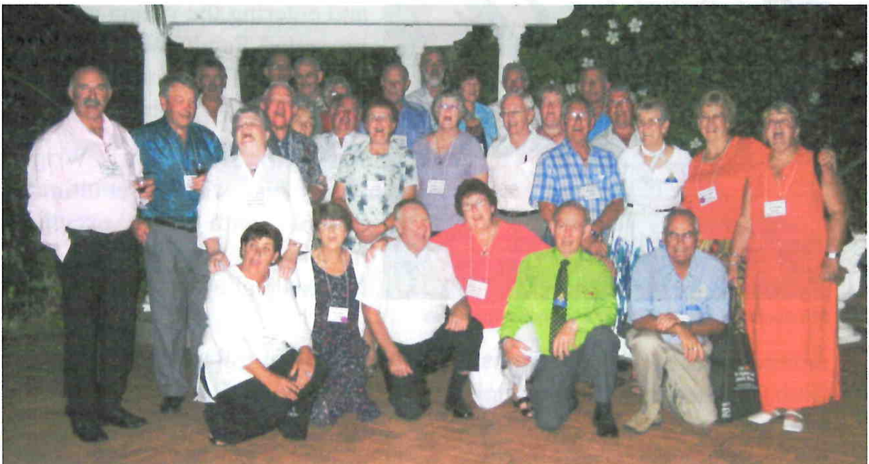
Wyong Rorters who attended the Apex 40 Tour of Canada when they were all a little younger